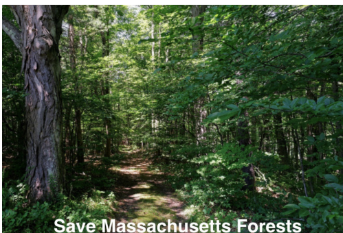
Save Massachusetts Forests

Learn more about IPL's Faith Climate Justice Voter campaign